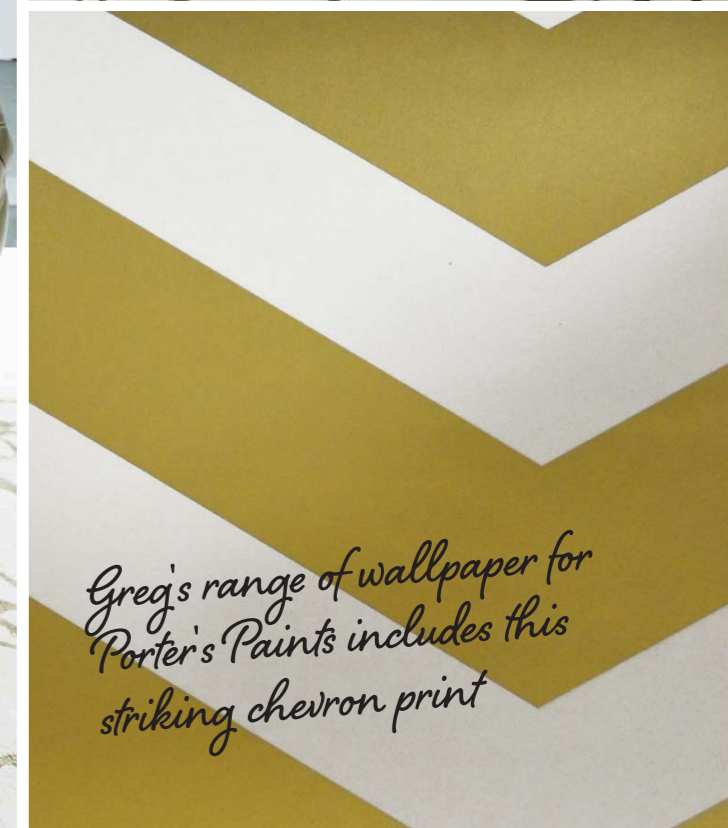
Greg's range of wallpaper for Porter's Paints includes this striking chevron print